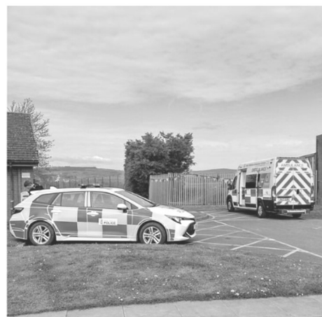
We made a lot of noise!