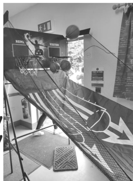
A new activity funded by donations