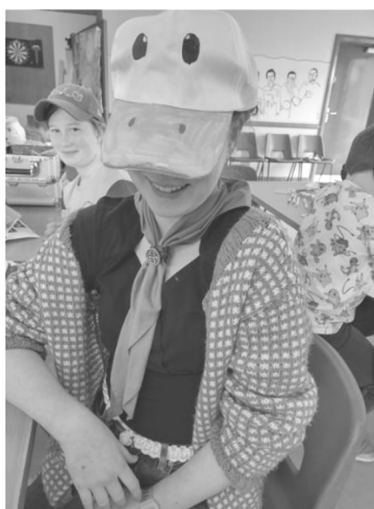
SYA brought crafts

Thank you also to those who helped with funding and provided activities.