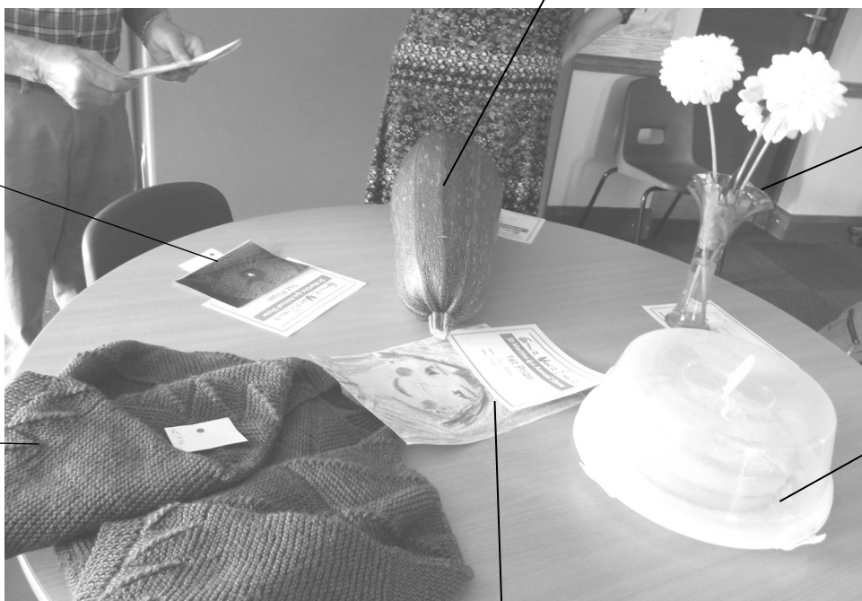
Lexi Davies' Picture of Someone I Love